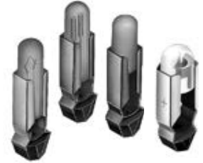
Changes for Select AT600 Lamps & LEDs

There will be changes for several AT600 lamps and LEDs. The material of the lamp holder base is changing from phenol resin to glass fiber reinforced polyamide. The NKK logo, identification on the bottom of the lamp holder base, will no longer appear. These revisions will apply to the standard AT part numbers specifically outlined below, and include custom AT parts.