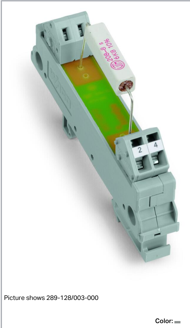
Picture shows 289-128/003-000