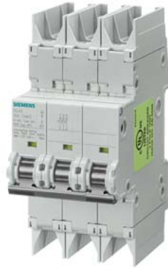
Circuit breaker 10kA, 3-pole, C, 2A according to UL 489-480Y/277V