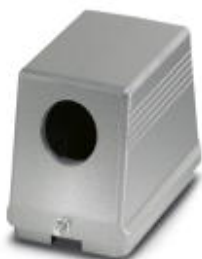
HEAVYCON sleeve housing B48, for single locking latch, height 96 mm, with thread 1x M40, lateral conductor exit

Please be informed that the data shown in this PDF Document is generated from our Online Catalog. Please find the complete data in the user's documentation. Our General Terms of Use for Downloads are valid ( http://phoenixcontact.com/download )