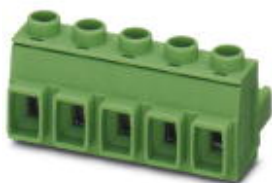
The figure shows the 5-position version of the product

PCB connector, nominal current: 16 A, number of positions: 4, pitch: 7.62 mm, connection method: Screw connection with tension sleeve, color: green, contact surface: Tin