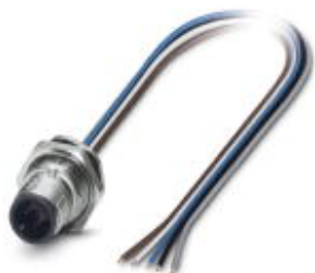
Sensor/actuator flush-type plug, 5-pos., M12 SPEEDCON, A-coded, rear/screw mounting with M16 thread, with 0.5 m TPE litz wire, 5 x 0.34 mm 2

Please be informed that the data shown in this PDF Document is generated from our Online Catalog. Please find the complete data in the user's documentation. Our General Terms of Use for Downloads are valid ( http://phoenixcontact.com/download )