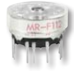
Changes for MRF Rotaries

2. The place of manufacture will change for MRF switches, the half-inch process sealed rotaries, and “JAPAN” will no longer appear on the switch case. In addition, the logo for MRF Rotaries will be updated. This modification will include all standard and custom devices.