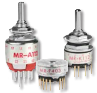
Changes for Miniature Process Sealed Rotaries

I. There will be production changes for MRA, MRF and MRK switches, the miniature process sealed rotaries. The lot number on the switch will be modified to have a dot mark above the first digit. The location of production will change, and the box in which the switches are packaged for shipping will read "CHINA FACTORY" instead of "JAPAN FACTORY." These modifications will apply to standard and custom products.