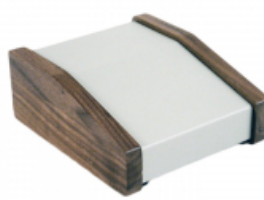
15 degree slope