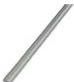
Continuous plug-in bridge, length: 500 mm, color: gray

Continuous plug-in bridge - FBST 500-PLC GY - 2966838