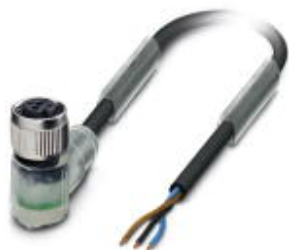
Sensor/actuator cable, 3-position, PUR halogen-free, black-gray RAL 7021, free cable end, on Socket angled M12 SPEEDCON, A-coded, with 2 LEDs, cable length: 3 m

Please be informed that the data shown in this PDF Document is generated from our Online Catalog. Please find the complete data in the user's documentation. Our General Terms of Use for Downloads are valid ( http://phoenixcontact.com/download )