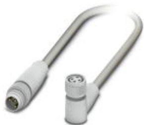
Sensor/actuator cable, 3-position, PP-EPDM halogen-free, gray RAL 7035, Plug straight M8, on Socket angled M8, with 2 LEDs, cable length: 3 m, Hygienic design, with plastic knurl

Please be informed that the data shown in this PDF Document is generated from our Online Catalog. Please find the complete data in the user's documentation. Our General Terms of Use for Downloads are valid ( http://phoenixcontact.com/download )