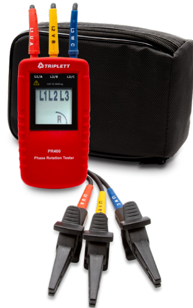
Motor and Phase Rotation Tester