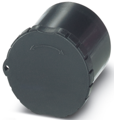
Plastic protection cap, antistatic, for RF, SF, CA, RC series connectors, with M23 external thread

Please be informed that the data shown in this PDF Document is generated from our Online Catalog. Please find the complete data in the user's documentation. Our General Terms of Use for Downloads are valid ( http://phoenixcontact.com/download )