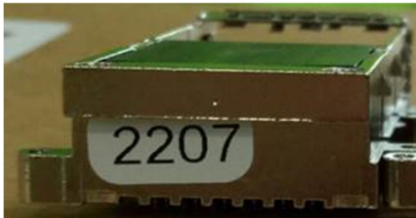
After "laser date code"