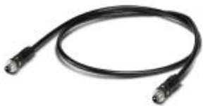
GOF MM cable, assembled with M12 OPTIC to M12 OPTIC

Assembled FO cable, round cable, 50/125 µm GOF-MM fiber, M12 to M12, for installation inside buildings