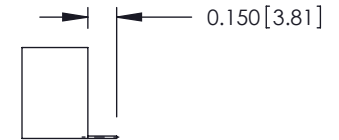
554 Contact Code