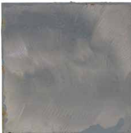
3M™ Cavity Wax Plus 08852 (3 coats)