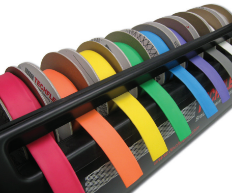
Shrinkflex shop spools fit into our dispenser kit (pg. 101) for easy storage and organization.

When economy is priority, 2:1 Shrinkflex heatshrink tubing is the answer. Not as versatile as a high ratio shrink product, 2:1 will still slide easily over small inline splices and connectors and provide a tight seal in many applications.