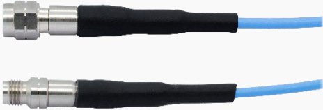
W205(50 GHz): 2.4 mm Connectors