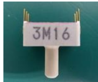
New (laser marking)