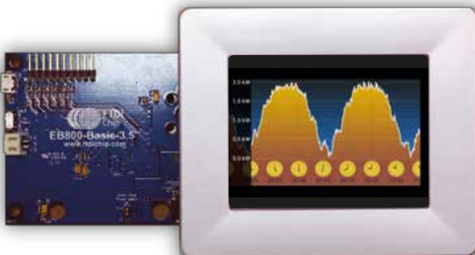
VM800B type development module

Low cost, finely finished video sub-system designed for industrial or commercial environments with precision, fitted bezel; offered in black or pearl (-PL).