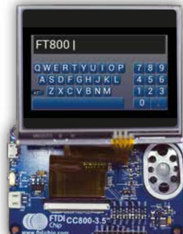
VM800C35A-D development module