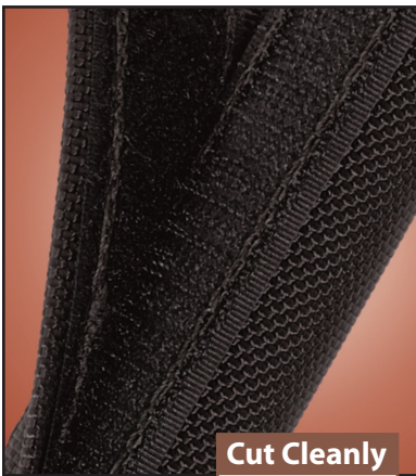
Cut Cleanly Scissor