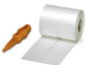
Marker for terminal blocks, Roll, white, Unlabeled, Can be labeled with: THERMOMARK ROLL, THERMOMARK X, THERMOMARK S1.1, Unperforated, Mounting type: Snap into universal marker groove, Snap into flat marker groove, Lettering field: 6.35 x 101.5 mm

Marker for terminal blocks - TMT 100 R - 0816605