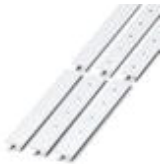
Zack marker strip, Strip, white, Unlabeled, Can be labeled with: Plotter, Mounting type: Snap into tall marker groove, For terminal block width: 15.2 mm, Lettering field: 10.5 x 15.1 mm

Zack marker strip - ZB 15:UNBEDRUCKT - 0811972