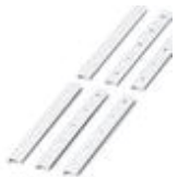
Zack Marker strip, flat, Strip, white, Unlabeled, Can be labeled with: Plotter, Mounting type: Snap into flat marker groove, Lettering field: 15 x 5.2 mm

Zack Marker strip, flat - ZBF 15:UNBEDRUCKT - 0811202