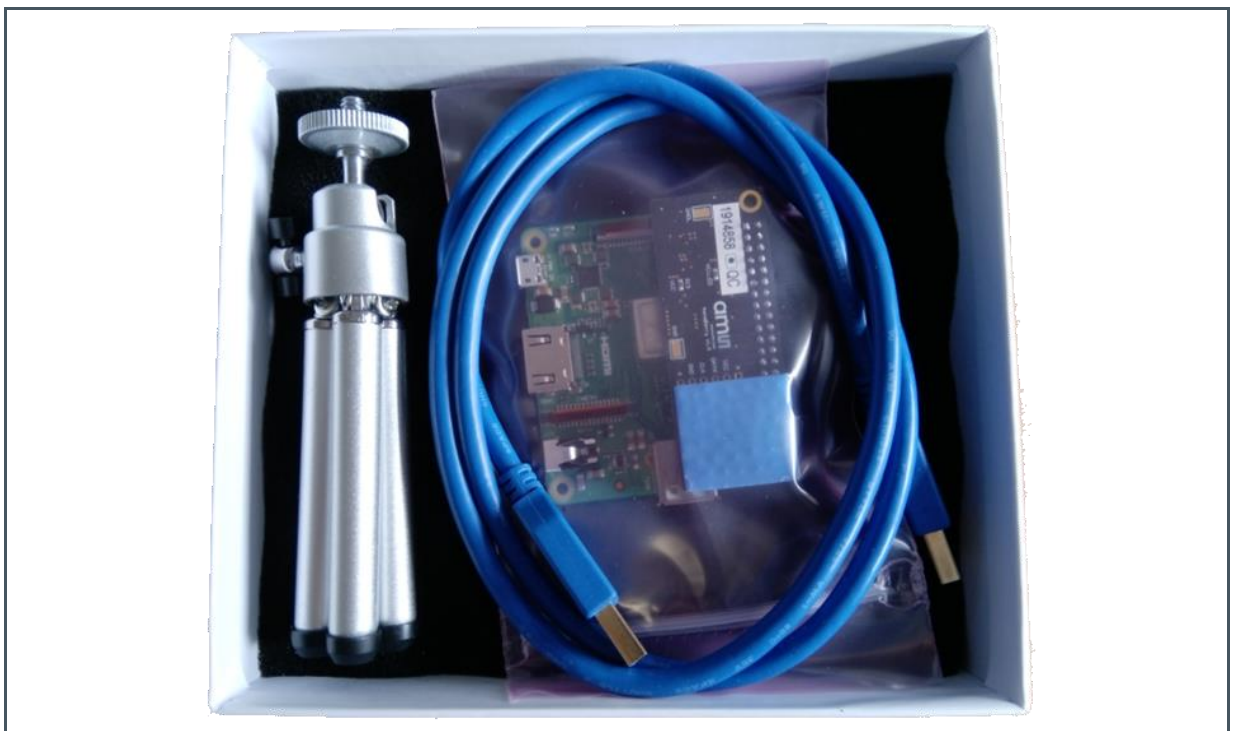
Figure 1: Eval Kit Content