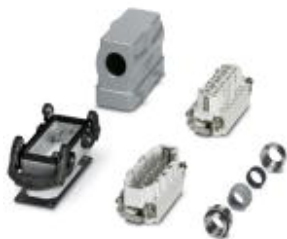
Connector set, consisting of: B16 sleeve housing and panel mounting base, 16-pos. plug and socket insert, M25 cable gland

Please be informed that the data shown in this PDF Document is generated from our Online Catalog. Please find the complete data in the user's documentation. Our General Terms of Use for Downloads are valid ( http://phoenixcontact.com/download )