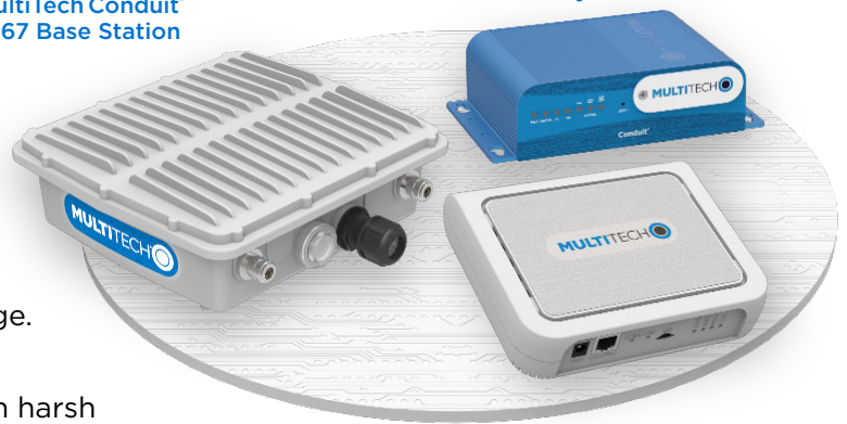
MultiTech Conduit® AP Access Point