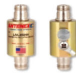
Lightning Arrestor LABH350NN (Sold Separately)