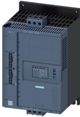
SIRIUS soft starter 200-480 V 38 A, 110-250 V AC spring-type terminals Thermistor input