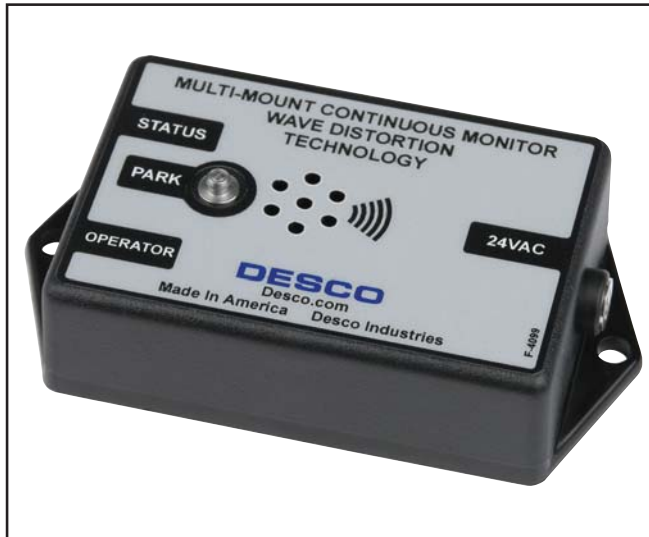
Figure 1. Desco Multi-Mount Continuous Monitor.