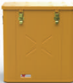
6012 Aluminium Container ext dims -600mm x 300mm x 600mm