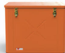
6022 Aluminium Container ext dims -800mm x 600mm x 600mm