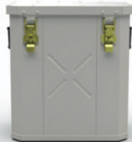
6001 Aluminium Container ext dims -400mm x 300mm x 400mm