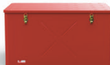
6032 Aluminium Container ext dims -1200mm x 800mm x 600mm