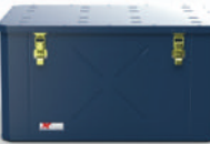
6021 Aluminium Container ext dims -800mm x 600mm x 400mm