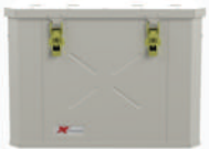
6011 Aluminium Container ext dims -600mm x 300mm x 400mm