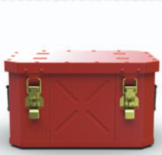
6000 Aluminium Container ext dims -400mm x 300mm x 200mm

Containers for expeditions photography film and audio- visual sports drones medical test and measurement offshore construction marine