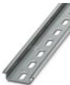
DIN rail, material: Galvanized, perforated, height 7.5 mm, width 35 mm, length: 2 m

DIN rail perforated - NS 35/ 7,5 ZN PERF 2000MM - 1206421