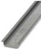
DIN rail, unperforated, Width: 35 mm, Height: 7.5 mm, Length: 2000 mm, Color: silver

DIN rail, unperforated - NS 35/ 7,5 AL UNPERF 2000MM - 0801704