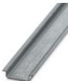
DIN rail, material: Galvanized, unperforated, height 7.5 mm, width 35 mm, length: 2 m

DIN rail, unperforated - NS 35/ 7,5 ZN UNPERF 2000MM - 1206434