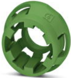
Fixing sleeve for M12 housing screw connection with tolerance-compensating function, for SMD-solderable M12 socket contact inserts.

Please be informed that the data shown in this PDF Document is generated from our Online Catalog. Please find the complete data in the user's documentation. Our General Terms of Use for Downloads are valid ( http://phoenixcontact.com/download )