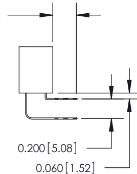
558 Contact Code

0.240 [6.10] Up to 27/54 Pin 0.162 [4.11] 28/56 and Over