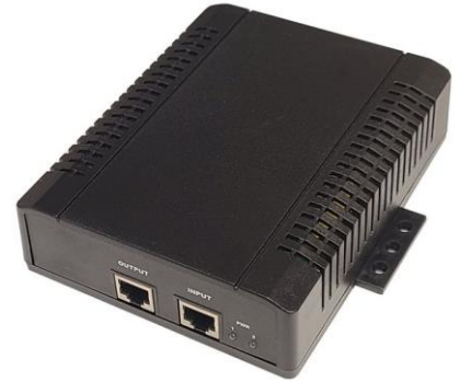
TP-POE-HP-56G High Power