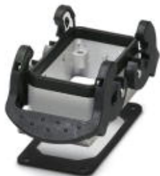
HEAVYCON B10 panel mounting base, with double locking latch, height: 29 mm, with flat gasket

Please be informed that the data shown in this PDF Document is generated from our Online Catalog. Please find the complete data in the user's documentation. Our General Terms of Use for Downloads are valid ( http://phoenixcontact.com/download )