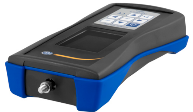
PCE-DFG N 200 Digital force gauge

For tensile force measurement and pressure force measurement up to 200 N / Very high accuracy / Sampling rate 1600 Hz / 6 different measuring tips / USB interface / Software / Calibration certificate