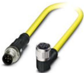
Sensor/actuator cable, 5-position, PVC, yellow, Plug straight M12 SPEEDCON, A-coded, on Socket angled M12 SPEEDCON, A-coded, cable length: 5 m

Please be informed that the data shown in this PDF Document is generated from our Online Catalog. Please find the complete data in the user's documentation. Our General Terms of Use for Downloads are valid ( http://phoenixcontact.com/download )