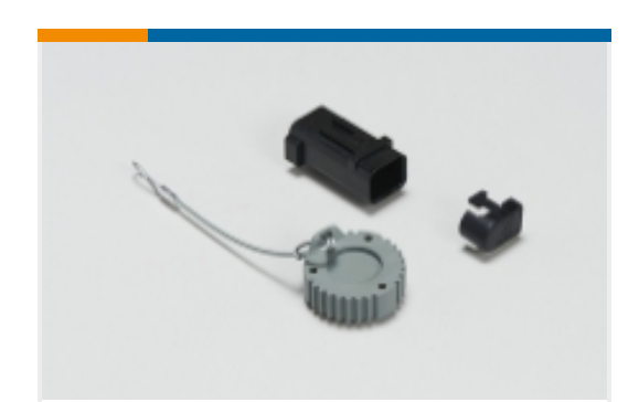
Automotive Connector Caps & Covers (107)