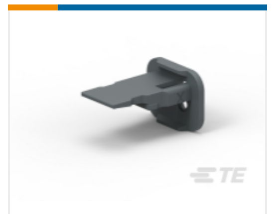
TE Part #W2SA-P012 WEDGE LOCK, 2P, PLG, GRY, SL RET, DT, A