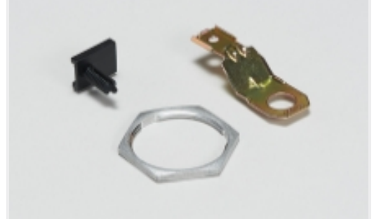
Other Automotive Connector Accessories(16)