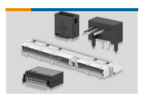
PCB Headers & Receptacles(102)