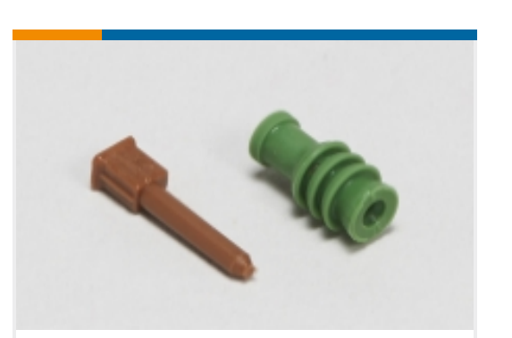
Automotive Seals & Cavity Plugs(5)