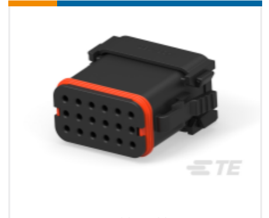
TE Part #DT16-18SA-K004 PLG, 18P, BLK, E, A