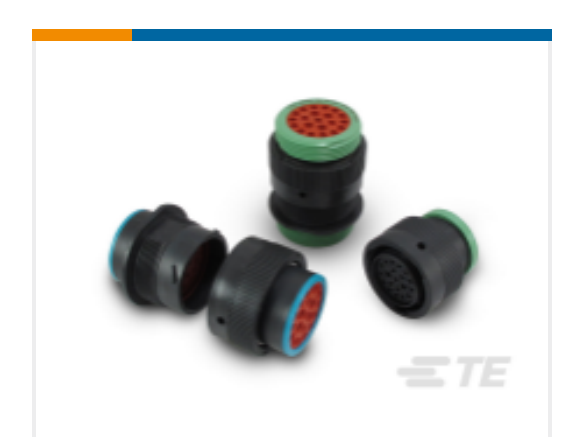
TE Part #HDP26-24-21PN-L017 DEUTSCH HDP20 Housings