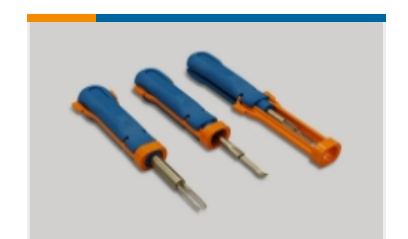
Insertion & Extraction Tools(3)