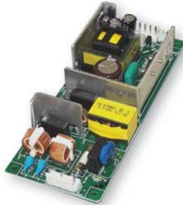
SWF100P-24 100 W