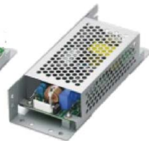
Chassis and Cover