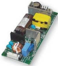
SWF050P-24 50 W