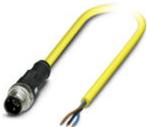
Sensor/actuator cable, 3-position, PVC, yellow, Plug straight M12 SPEEDCON, A-coded, on free cable end, cable length: 2 m

Please be informed that the data shown in this PDF Document is generated from our Online Catalog. Please find the complete data in the user's documentation. Our General Terms of Use for Downloads are valid ( http://phoenixcontact.com/download )