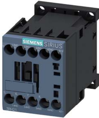
Contactor relay, 4 NO, 12 V DC, Size S00, screw terminal