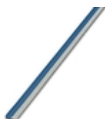
Continuous plug-in bridge, length: 500 mm, color: blue

Continuous plug-in bridge - FBST 500-PLC BU - 2966692