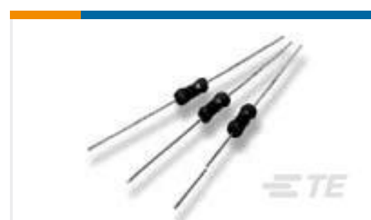
TE Part #1-1625890-4 2W SM M/OX 5% 15K