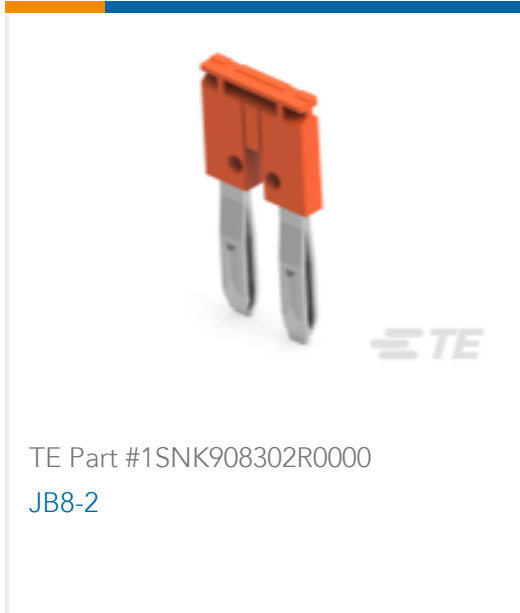
TE Part #1SNK908302R0000 JB8-2