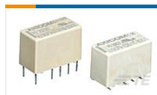
TE Part #1-1393788-6 V23079A1005B301