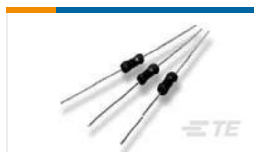
TE Part #3-1625892-7 3W SM M/OX 5% 2K2