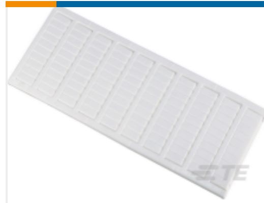
TE Part #1SNK145011R0000 MC512PA 1->100 Horizontal