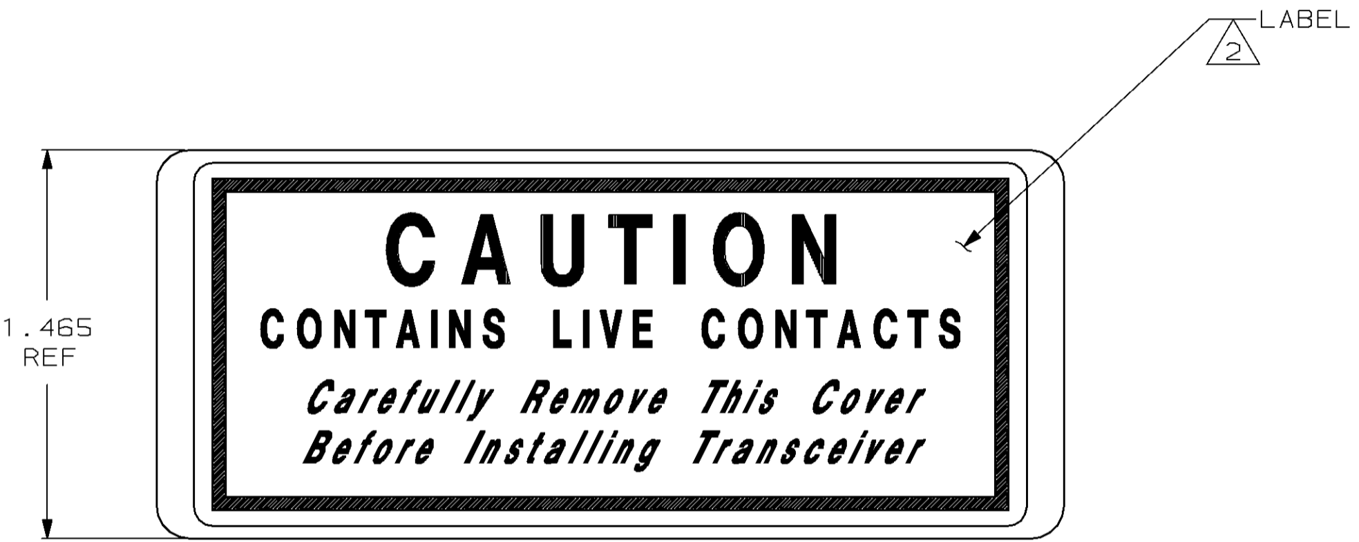
221057-1 LABEL AS SHOWN VIEW A