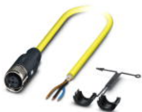
Sensor/actuator cable, 3-position, PVC, yellow, shielded, free cable end, on Socket straight M12 SPEEDCON, A-coded, cable length: 5 m

Please be informed that the data shown in this PDF Document is generated from our Online Catalog. Please find the complete data in the user's documentation. Our General Terms of Use for Downloads are valid ( http://phoenixcontact.com/download )