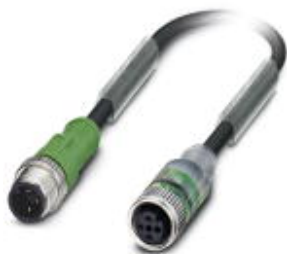
Sensor/actuator cable, 3-position, Variable cable type, Plug straight M12, A-coded, on Socket straight M12, A-coded, with 2 LEDs, cable length: Free input (0.2 ... 40.0 m)

Please be informed that the data shown in this PDF Document is generated from our Online Catalog. Please find the complete data in the user's documentation. Our General Terms of Use for Downloads are valid ( http://phoenixcontact.com/download )