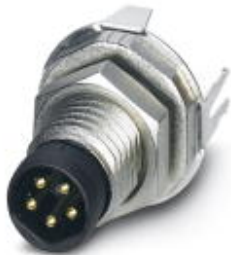
Sensor/actuator flush-type plug-in connector, plug, 5-pos., DeviceNet, M8, rear/screw mounting with M10 fastening thread, with straight solder connection

Please be informed that the data shown in this PDF Document is generated from our Online Catalog. Please find the complete data in the user's documentation. Our General Terms of Use for Downloads are valid ( http://download.phoenixcontact.com )