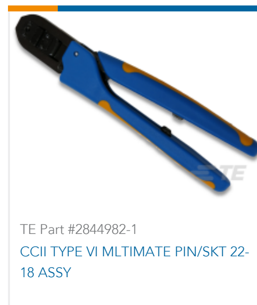
TE Part #2844982-1 CCII TYPE VI MLTIMATE PIN/SKT 22-18 ASSY