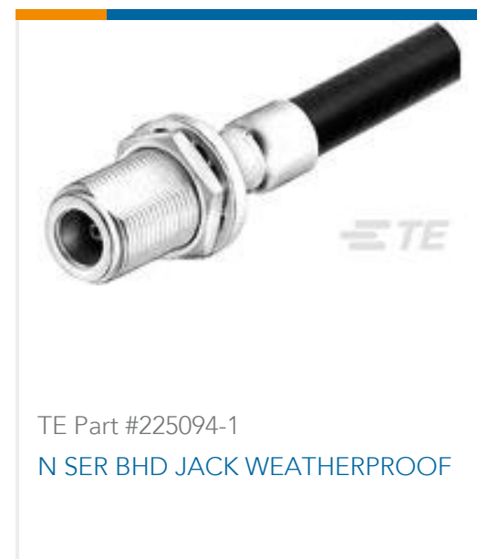
TE Part #225094-1 N SER BHD JACK WEATHERPROOF