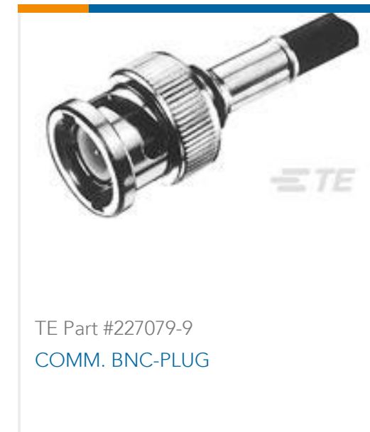
TE Part #227079-9 COMM. BNC-PLUG