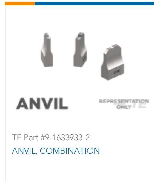
TE Part #9-1633933-2 ANVIL, COMBINATION