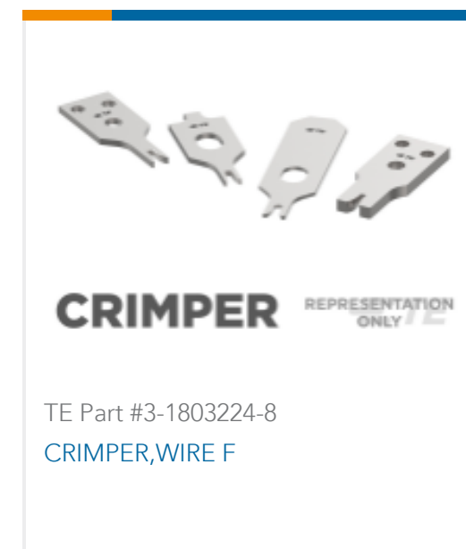
TE Part #3-1803224-8 CRIMPER, WIRE F