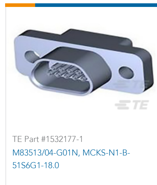
TE Part #1532177-1 M83513/04-G01N, MCKS-N1-B-5156G1-18.0