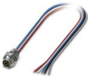
Bus system flush-type connector, plug, DeviceNet, 5-pos., M8, front/screw mounting with M8 fastening thread, with 0.5 m PVC litz wire, 5 x 0.25 mm 2

Please be informed that the data shown in this PDF Document is generated from our Online Catalog. Please find the complete data in the user's documentation. Our General Terms of Use for Downloads are valid ( http://phoenixcontact.com/download )