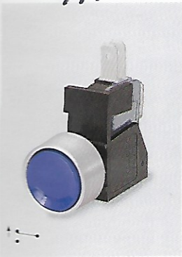
383 2510 K BL